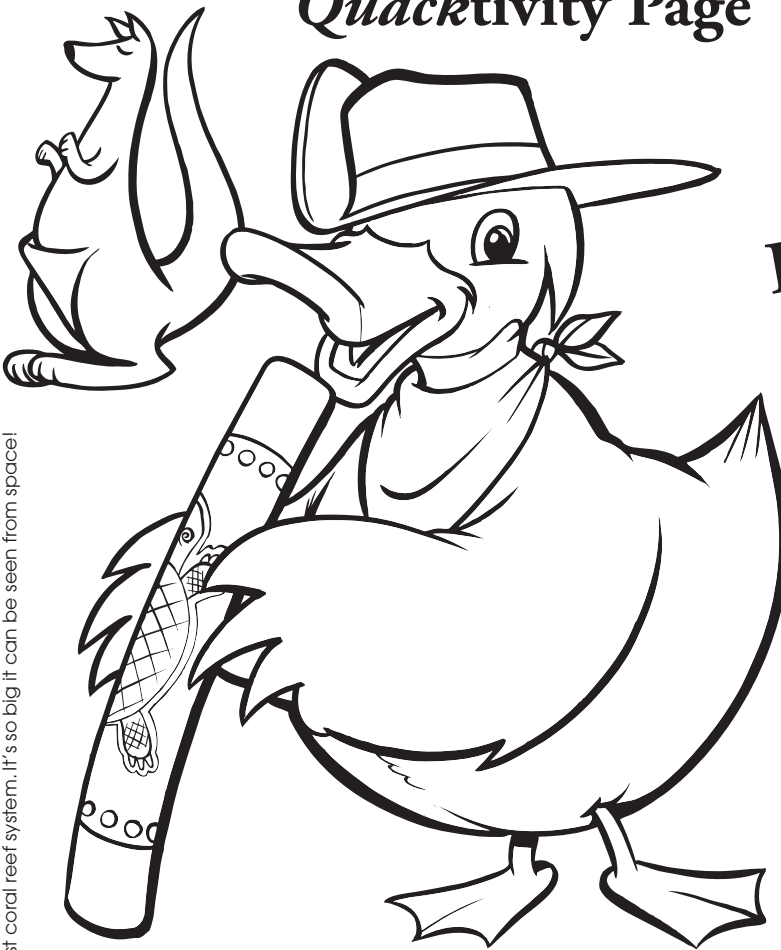
That's One Big Reef! The Great Barrier Reef is the world's largest coral reef system. It's so big it can be seen from space!